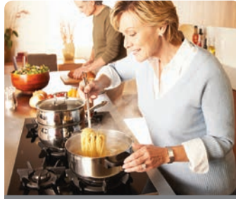
PEACE OF MIND