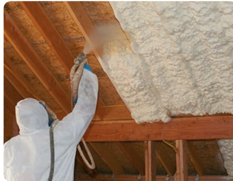
Spray Foam Insulation