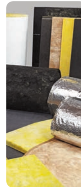
HVAC / Mechanical