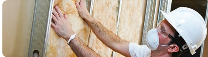
CertaPro™ Commercial Insulation