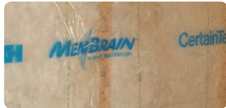
Air & Moisture Management