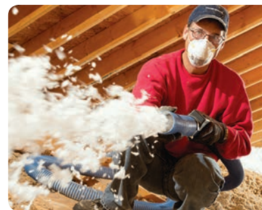
Premium Blow-in Insulation