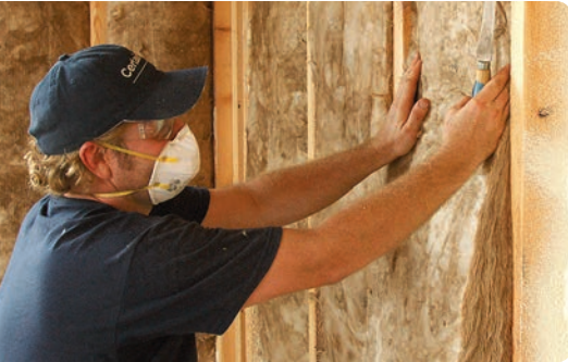
Residential Sustainable Insulation

For every insulation challenge, there's a CertainTeed solution.