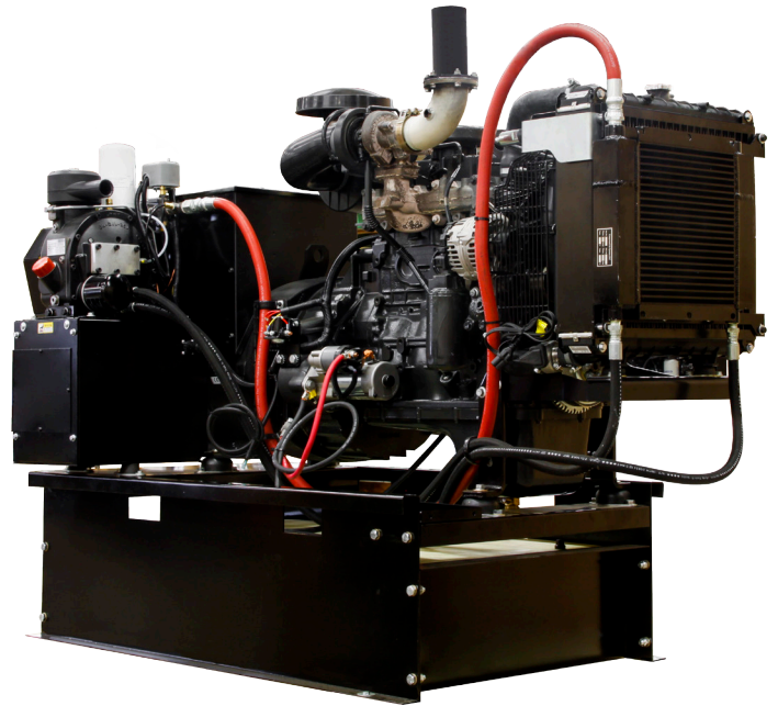
DE4040 - 40kW with 40 CFM @120 psi